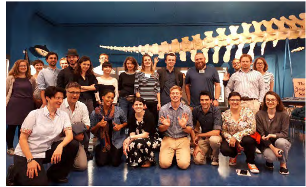
Summerschool Collecting and the Knowledge of Objects

Zentrale Kustodie, Georg-August-Universität Göttingen Weender Landstraße 2 / Auditorium, 37073 Göttingen <u>kustodie@uni-goettingen.de</u>, <u>www.kustodie.uni-goettingen.de</u>