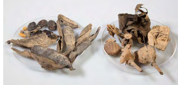
Neuzugang: Paläo-Ethnobotanische Sammlung